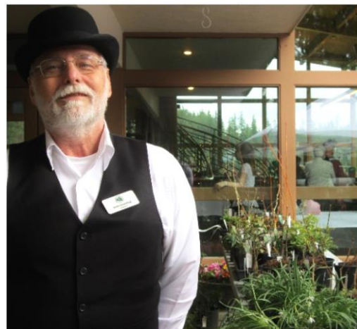
Smith-Mossman Western Azalea Garden