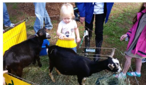
FAMILY FUN ... AND GOATS!