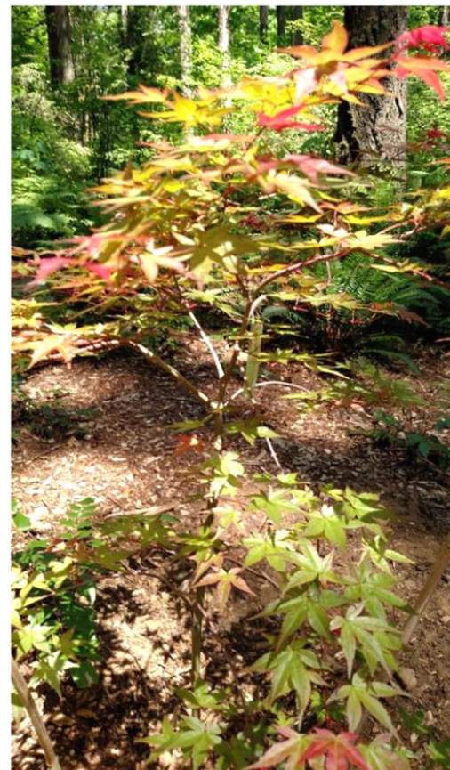
The stolen 'Shin Deshojo' Maple donated in honor of the Arboretum's 50th Anniversary by the Late Bloomers Garden Club.